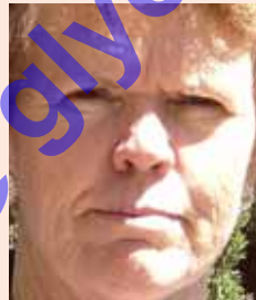
After 1 month