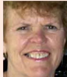
After 3 months

I am so thrilled about the skin care system and what it has done for me. I was in the labor union for seven years working as a flag person on highway construction. We often worked ten hours a day, six days a week. This was at a time when sun block was virtually unheard of.