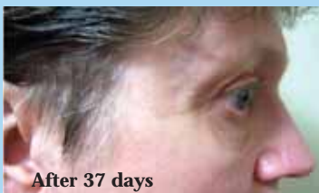
After 37 days

I have never used any skin care products before, but after hearing about this one, I decided to give it a try. I'm so glad I did. This skin care system has helped my face look younger. In fact, it's like 10 years have been erased.