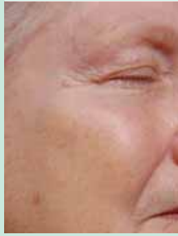
After 8 weeks

When I began using the system, I felt a tightening of my skin from the inside. It was strange, but it was like my cells were moving closer together. It wasn't the outer skin that pulled, but the inside. Three days after I started using it, people could already see a difference. My face felt like it was actually lifting.