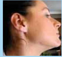
After 3 weeks

I began using the skin care system after having tried everything else on the market. As a teenager I had gorgeous, flawless skin. When I entered my twenties, I started breaking out. It was very frustrating for me. After going through nearly every skin care line on the market, I began to give up.