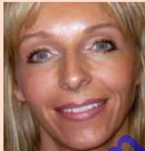
After 10 months

I started this skin care system in early September, and by January my skin had completely changed. Now after ten months, I can't believe all the compliments I get. My skin is much more radiant. My eyelids have lifted and the puffiness around my eyes is gone. The fine lines are going away and my pores are smaller. What more could you ask for?